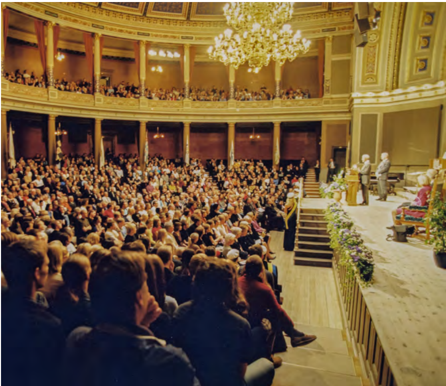
Kofi Annan (1938-2018), delivering the 2001 Dag Hammarskjöld Lecture.

The invited speaker should be an outstanding international personality who in significant and innovative ways contributes to a more just, peaceful and environmentally sustainable world through valuable achievements in politics or research. Further information about the annual Dag Hammarskjöld Lecture including the full list of previous lecturers as well as their published speeches, can be found online at www.daghammarskjold.se .