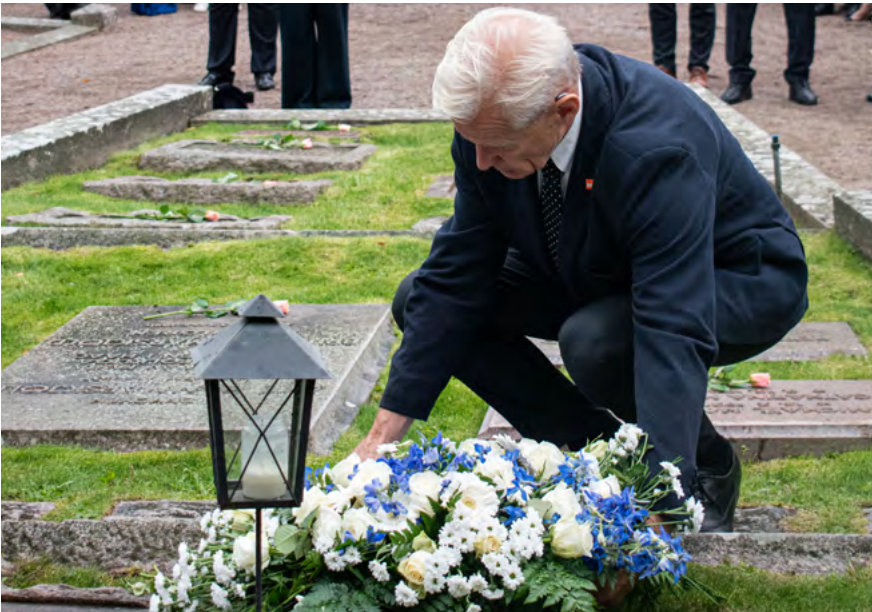
Jan Egeland laying flowers at Dag Hammarskjöld's grave in Uppsala.